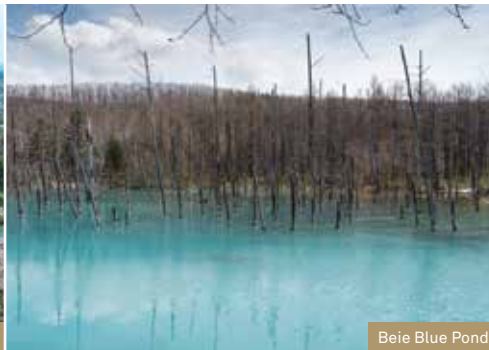
Beie Blue Pond